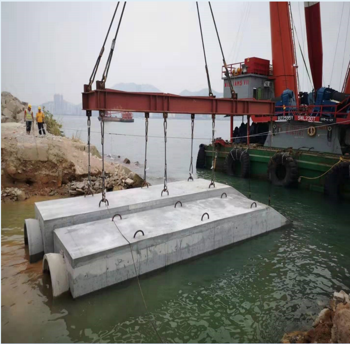
香港启德预制件安装 (2019) Lifting Installation of Precast Blocks at Kai Tak, HK