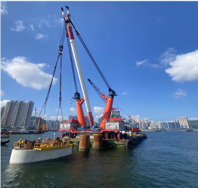
香港将军澳大桥吊装水下桥墩 Lifting Installation of Underwater Piers of Tseung Kwan O Bridge, HK