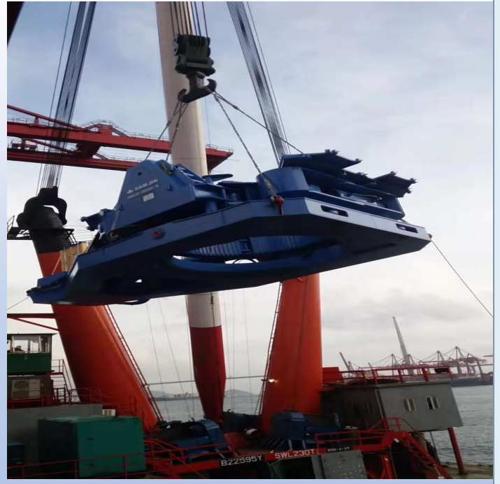
香港葵涌码头吊装工程 (2019) Lifting Installation at Kwai Chung Ferry Pier, HK